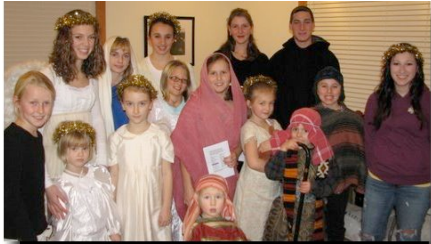
The youngest of the 30+ participants in this year's Family Christmas Eve Service

On a bleak midwinter's night, angels, shepherds and a menagerie of animals made their way to a straw filled manger and the Christ Child within. Families and children in the surrounds of candlelight and musical offerings brought the Christmas story to life once again. Shared with over 100 worshipers watching and celebrating, the 5:00 pm Christmas Eve service reflected the miracle of God's coming in the young and vulnerable.